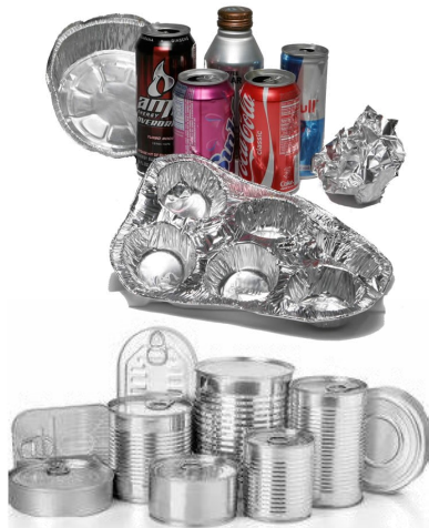
Metal Cans, Lids & Foil

Latas y tapas de metal, papel de aluminio