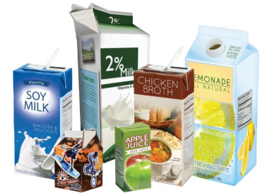
Milk or Juice Carton Leché o Jugo de Carton