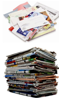
Clean Paper & Flattened Cardboard

Latas y tapas de metal, papel de aluminio