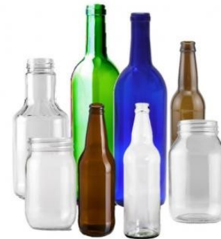
Glass Jars & Bottles Frascos y botellas de vidrio