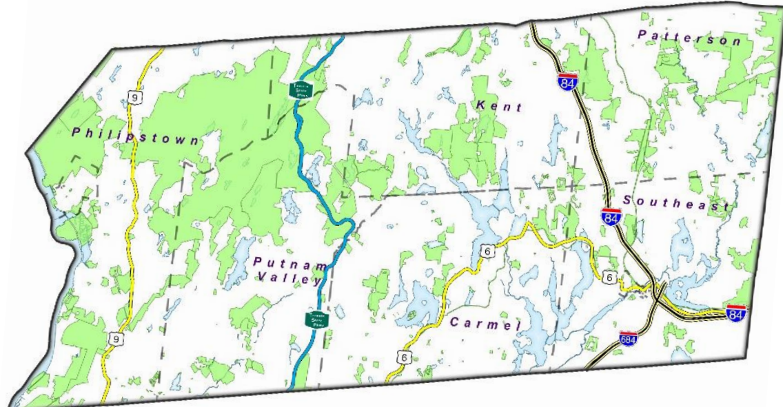
This is an update of the Original 2010 Mid-Hudson Regional Greenhouse Gas Emissions Inventory Final Report.<sup>1</sup>